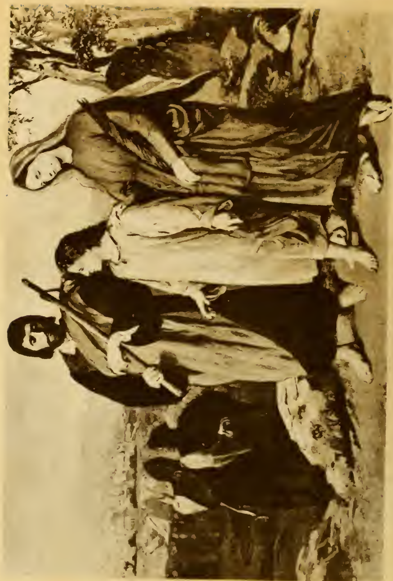
"And when He was twelve years old, they went up to Jerusalem at the solemn day of the Pasch."